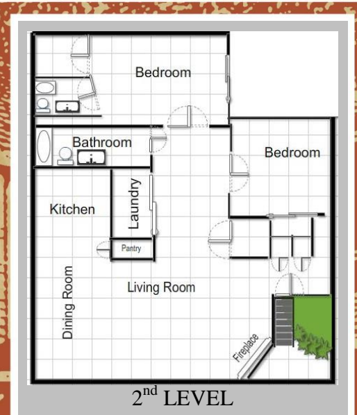
2 nd LEVEL